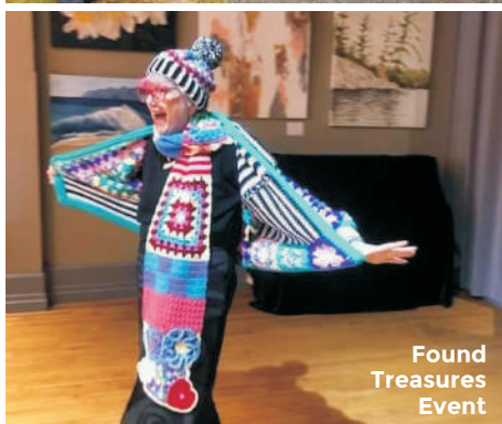
Found Treasures Event