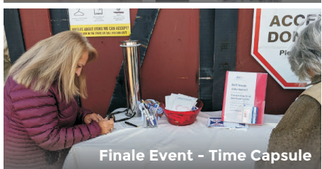
Finale Event - Time Capsule