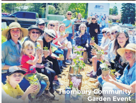
Thornbury Community Garden Event