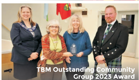
TBM Outstanding Community Group 2023 Award