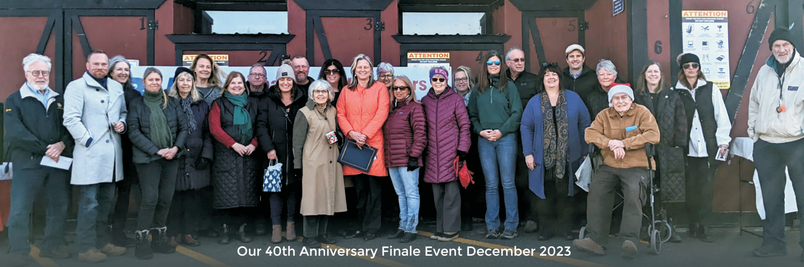
Our 40th Anniversary Finale Event December 2023