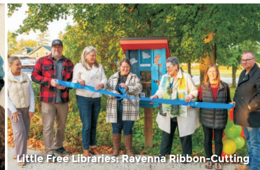
Little Free Libraries: Ravenna Ribbon-Cutting

Space Needs Analysis: BVO hired the architectural firm of +VG to do a space needs analysis of our building and property, and to produce concept drawings showing how we might increase efficiencies through improvements and expansion of our facility.