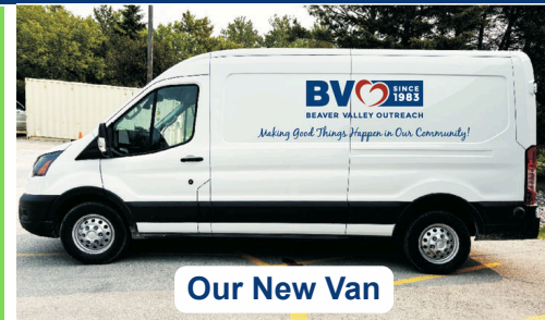
Our New Van